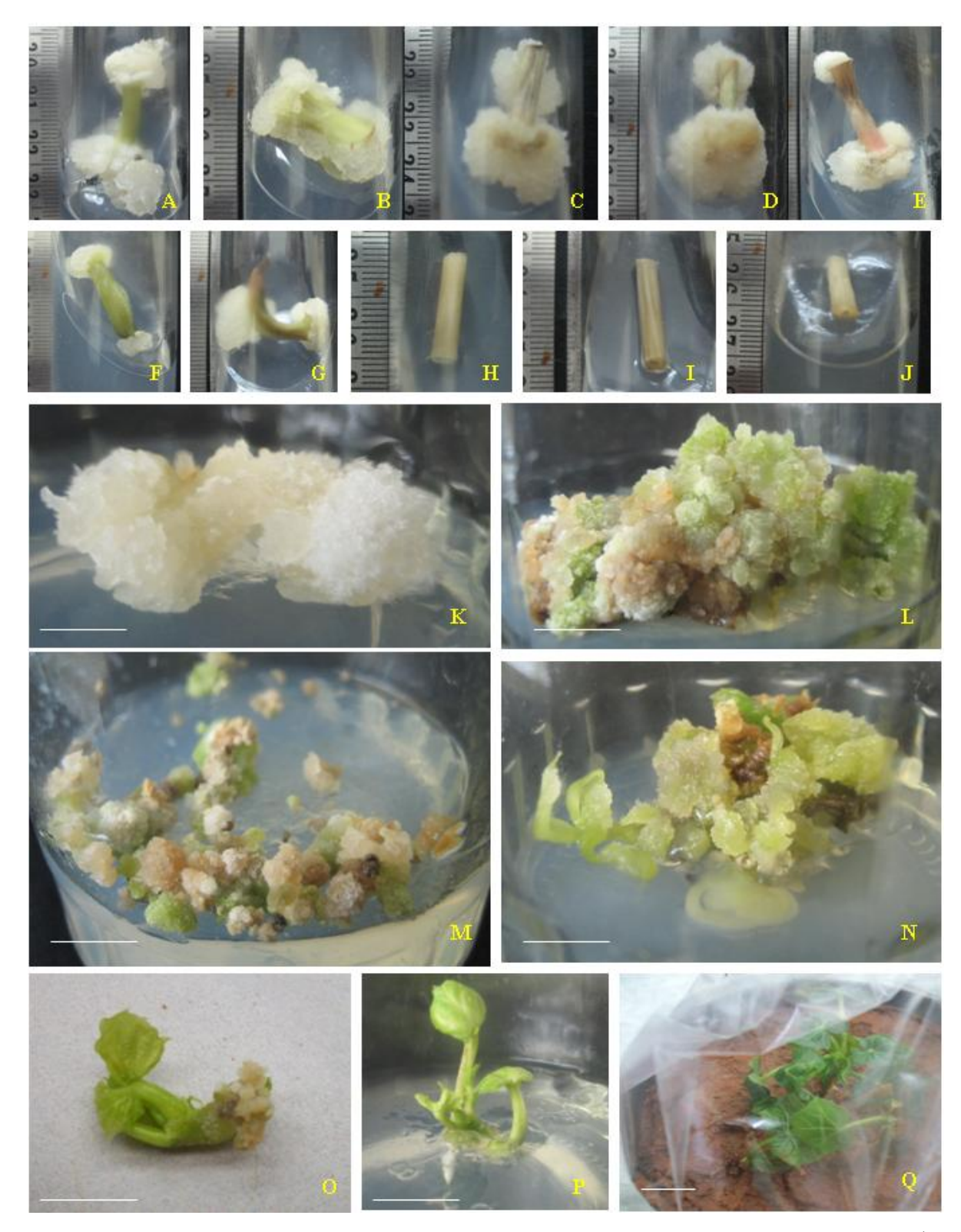
Figure 1. A-Q, Plant regeneration from different ages of petiole of Jatropha curcas L.; A-J, callus formation from 1<sup>st</sup> to 10<sup>th</sup> petiole after two weeks of culture; K, callus growth on MS medium supplemented with 1 mg/l NAA in combination with 0.2 mg/l KN from 1<sup>st</sup> petiole after five weeks of culture (scale 10 mm); L and M, different stages of somatic embryogenesis (scale 10 mm); N, germination of somatic embryos resulting after 6 week culture (scale 10 mm); O, elongated shoots after three weeks of culture on MS with 0.5 mg/l TDZ, 0.1 mg/l BA and 0.4 mg/l GA<sub>3</sub> (scale 12 mm); P, in vitro rooted shoot on MS medium supplemented with 3 mg/l NAA (scale 12 mm); Q, in vitro rooted plants hardening at mist chamber (scale 15 mm).