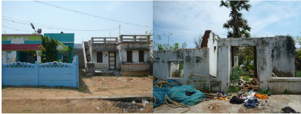
Figure 2. Post-tsunami colony houses on left (some individuals have upgraded their basic tsunami houses as they are able to afford it) and tsunami-destroyed house on right.

claimed not to experience additional stress during the ban period. The overall response rate in both villages was 75% (i.e., 127 participants out of 170 total individuals contacted in Kottucherry Medu and 155 of 208 contacted in Nambiyar Nagar). There is no reason to believe the sample is biased as those that declined to participate or dropped out of the survey were spread across sexes. 3