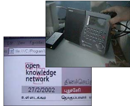
Towards a network for the rural poor of the world

We use technology when it provides a distinct advantage. We have so far used hybrid wired and wireless technology for