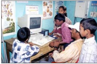
Children learning to draw on a PC at Veerampattinam

What are the lessons we have learnt from our own project and the experience of others in the past few years? Is this model sustainable? To someone who has had the privilege of watching every step from close quarters, it is clear that technology by itself may not mean much and one needs to take care of the context, content and language. Let us list the factors that led to our success: