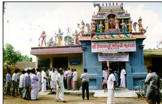
The door to modernity and the door to tradition at Embalam temple

“Embalam - In this village, the century-old temple has two doors. Through one lies tradition. People from the lowest castes and menstruating women cannot pass its threshold. Inside, the devout perform daily pujas, offering prayers. Through the second door lies the Information Age, and anyone may enter. In a rare social experiment, the village elders have allowed one side of the temple to house two solar-powered computers that give this poor village a wealth of data, from the price of rice to the day's most auspicious hours.”