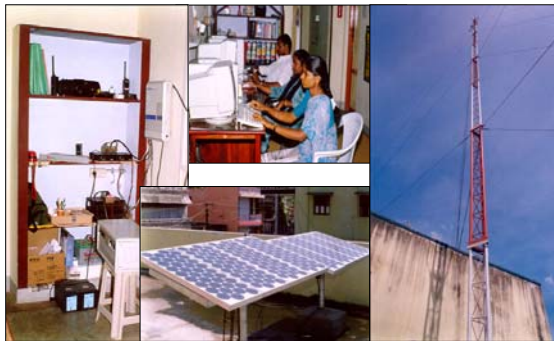
VHF two-way radio, Internet, Spread spectrum antenna and solar panels at Villianur

In an experiment in electronic knowledge delivery to the poor, we have set up knowledge centers