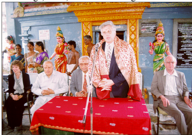
Prof. Bruce Alberts addressing the people of Embalam

“I examined an imaginative set of experiments in electronic knowledge delivery designed by our foreign associate, M.S. Swaminathan, ... .. connecting scientists to each other is only the first step. Scientists everywhere must use these initial connections as a tool for spreading their knowledge, skills, and values throughout their own nations, including their local communities. By