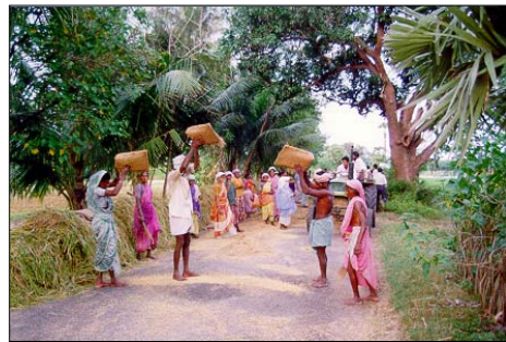
These landless labourers now get correct wages

We understood the need to develop ‘content’ – the information needed to satisfy the communities’ needs - and developed much of the content in collaboration with the local people. We have created close to a hundred databases, including rural yellow pages, which are updated as often as needed. Incidentally, the entitlements database, which serves as a single-window for the entire gamut of government programmes, has created so much awareness among the rural poor that there is greater transparency in government now. Farmers get the right price for their farm produce and wage-labourers get the right wages from their employers, thanks to the knowledge centers. We are not averse to borrowing ‘content’ from elsewhere if it is found useful to the local community. For example, we have collected much useful information from Government departments, the Tamil Nadu Agricultural University, Aravind Eye Hospital, and the US Navy’s website. We have held a few health camps in the villages in cooperation with well-known hospitals as part of gathering information about local health care needs.