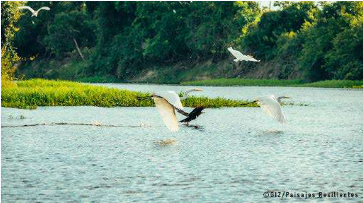
Wildlife is abundant in the wetlands around Bolivia's Paraguá River.

The zone of the upper Paraguá River in Bolivia is an area rich in wetlands, temporary flood zones, and biodiversity. It is very important for water regulation, and very vulnerable not only to the effects of climate change but also to anthropic actions linked to forest fires, deforestation, and unsustainable agricultural production practices. The Resilient Landscapes in the Chiquitania, Santa Cruz (2020-2024) project is co-financed by the European Union and the German Development Cooperation, implemented by GIZ within its project PROCUENCA. This contains the pilot project Wetland conservation through sustainable production practices, resilient communities, and participative water flow monitoring. The goal is to promote transformative alternatives towards sustainable productive systems that reduce the pressures being exerted on wetlands.