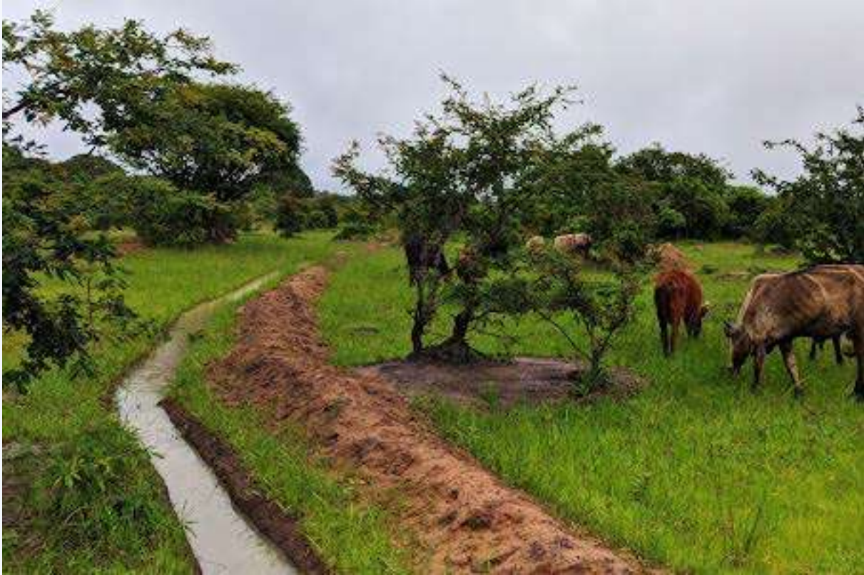
Soil bunds for harvesting water

Zambia's water resources are under pressure due to an increase in demand caused by population and economic growth. Climate change, droughts, and shifting rainfall patterns heavily impact the availability and supply of water for domestic, industrial, and agricultural use nationwide. Smallholder farmers in the Lower Kafue Sub-Catchment (LKSC) in the Southern and Central parts of Zambia are particularly affected by climate variability. On top of this, catchment degradation aggravates the situation. Factors like deforestation lead to higher erosion, eventually causing siltation of rivers and reservoirs, reduced groundwater recharge, and loss of fertile soils. In line with Zambia's Water Resources Management Act No. 21 of 2011, the European Union (EU) and Germany's Federal Ministry for Economic Cooperation and Development (BMZ) funded the AWARE project that implemented 16 Catchment Protection Measures through Integrated Watershed Management in the LKSC.