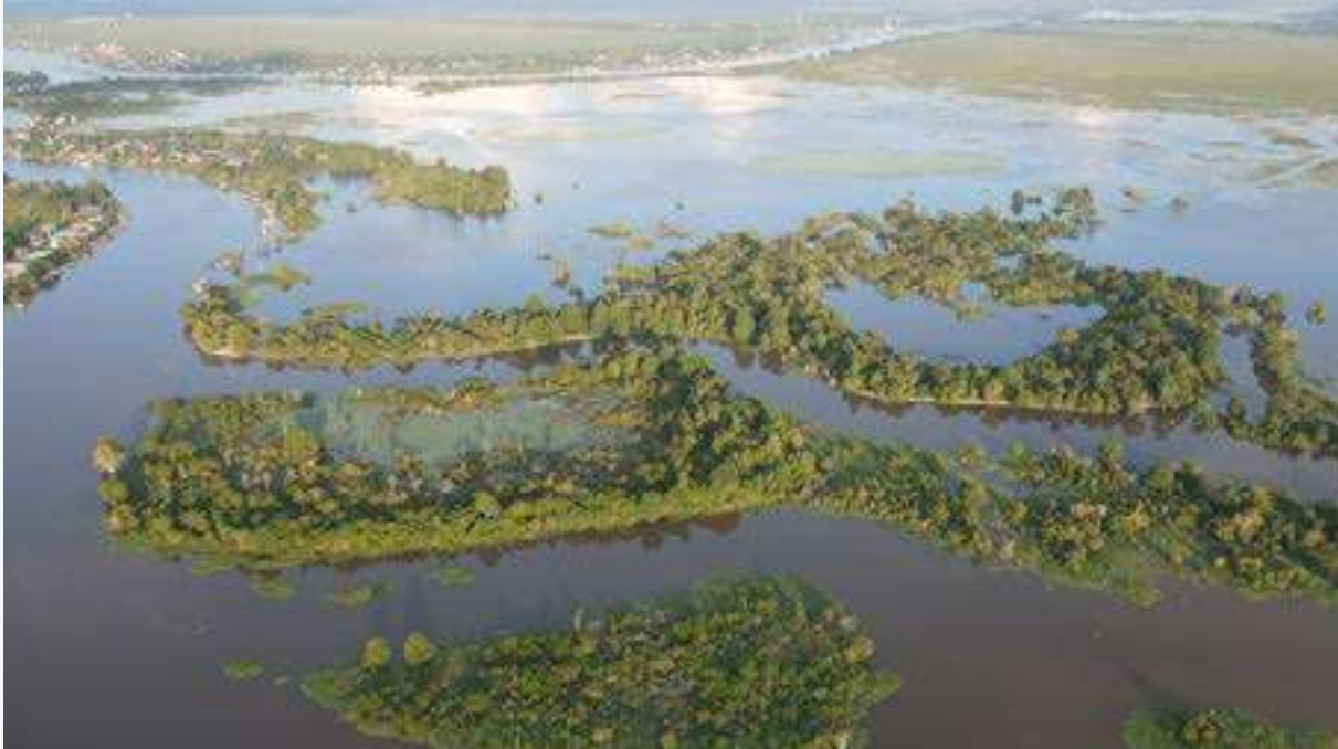
An aerial view of Indonesia's Middle Mahakam peatlands

The peat ecosystem is known for its fundamental function in absorbing, holding, and regulating water. This unique ecosystem is threatened by unsustainable management and a lack of knowledge at the local level in dealing with agriculture in the peatlands, the potential results of which include loss of soil productivity, flooding, and land fires.