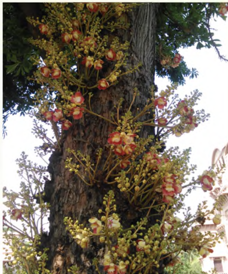
Tree in full bloom