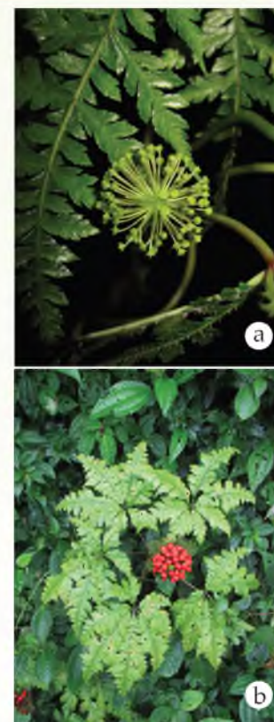
a. Inflorescence; b. Plant with infructescence