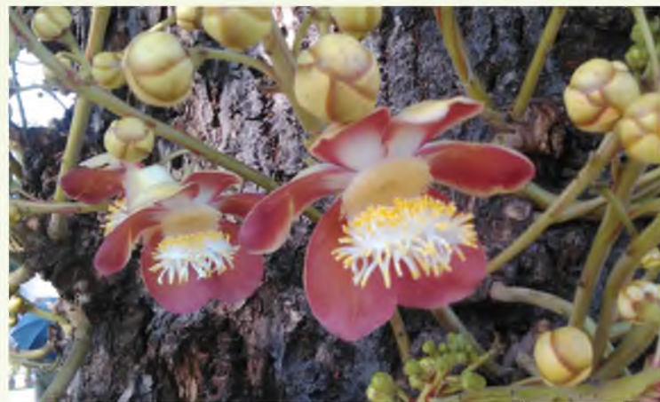
Flowers in close-up

Notes: Flowers are without nectar and are mostly visited by bees in search of pollen; carpenter bees are the chief pollinators. Fruits attain maturity in 12 to 18 months and the cannon ball-like matured fruits crack open upon hitting the ground.