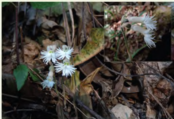
Cheirostylis griffithii : Habit; inset: Flowers (side view)