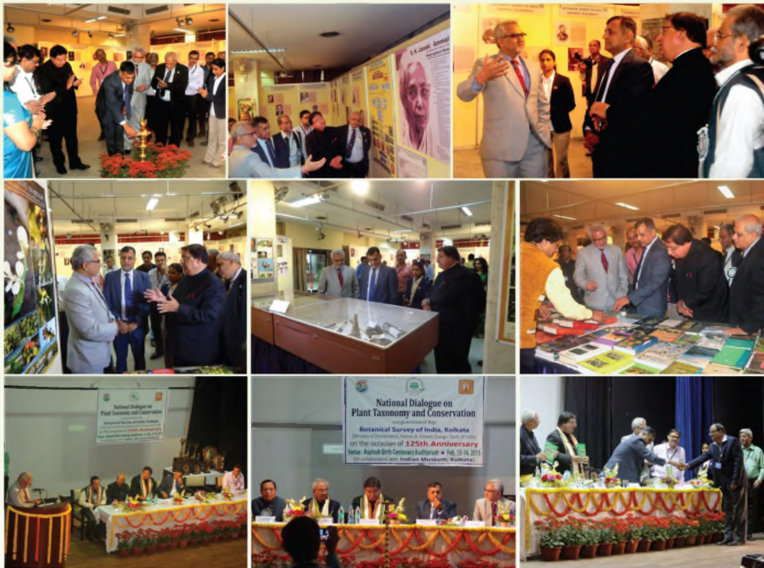
Celebration of 125th Anniversary of Botanical Survey of India held at Asutosh Birth Centenary Hall, Indian Museum, Kolkata, on 13th and 14th February 2015