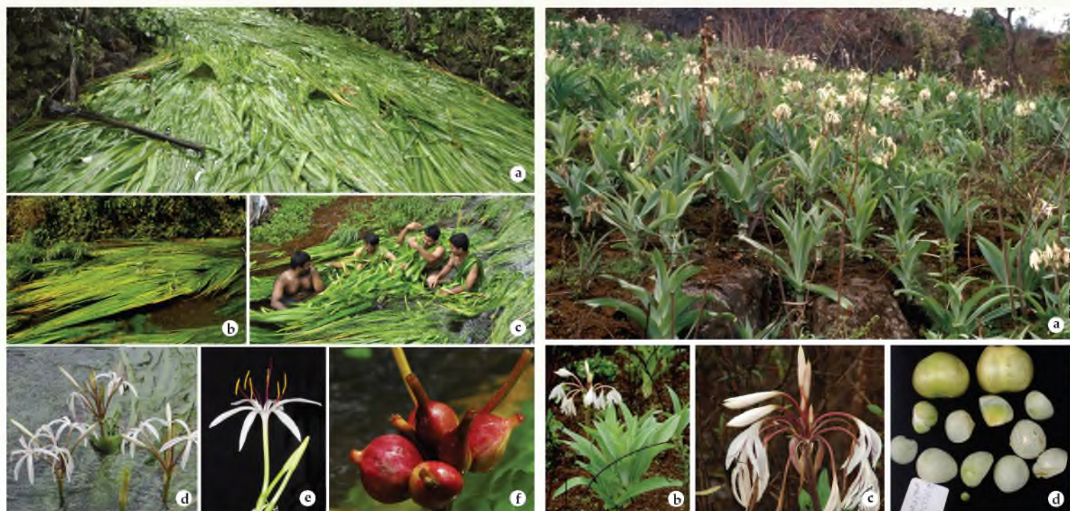
Crinum malabaricum : a, b & c. Leaves; d. Inflorescences; e. Flower; f. Fruits