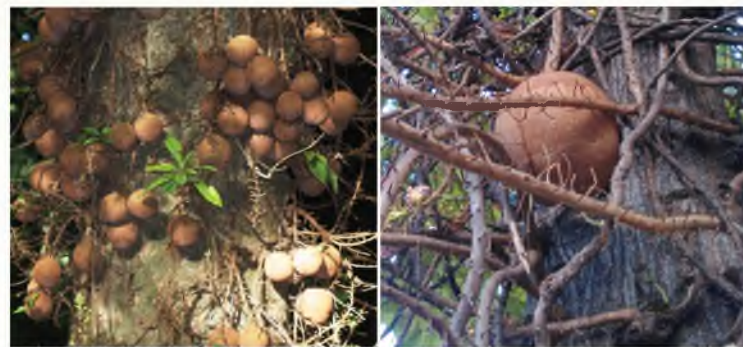
Young and mature fruits