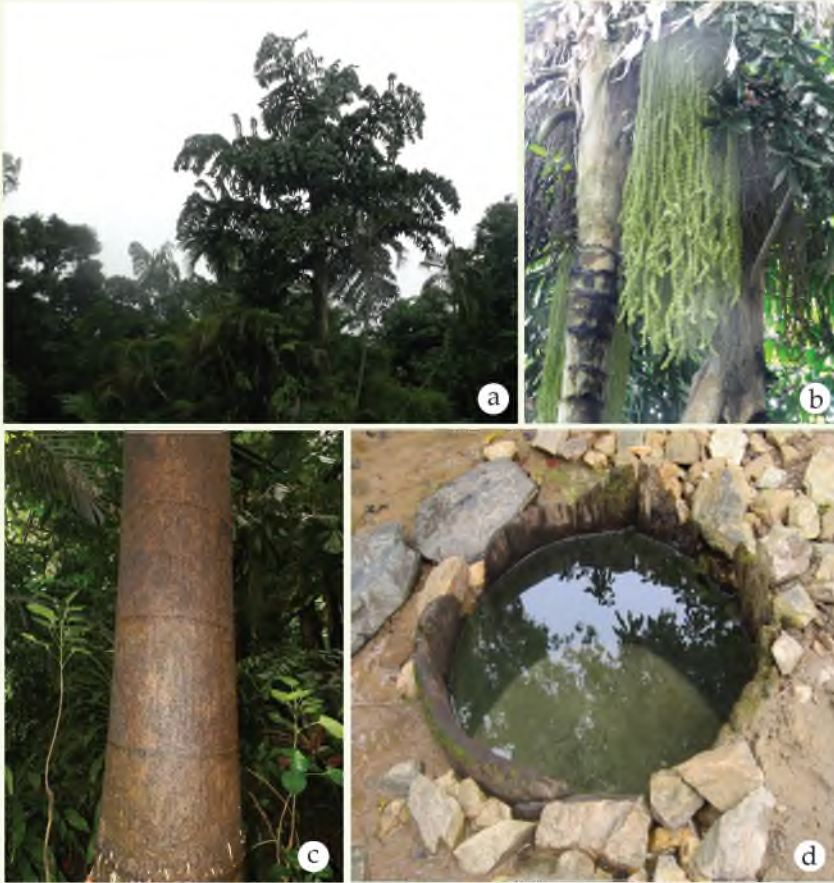
Caryota urens : a. Habit; b. Inflorescence; c. Stem; d. Panamkutty

evergreen forests of Wayanad district as well as in the farmyards and sacred groves of the area. Panamkutty is usually made in the valleys of hills and in the vicinity of natural springs where the mature hollowed stem of the Pana will be plunged deep into the surface of the area selected, so that water inside the stem will not be polluted.