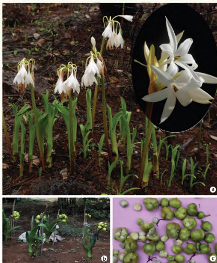
Crinum brachynema : a. Habit; b. Fruits by artificial cross pollination; c. Seeds

Department of Botany, Shivaji University, Kolhapur had taken initiatives for the conservation of Crinum species in India. Survey and documentation of the range of distribution of the