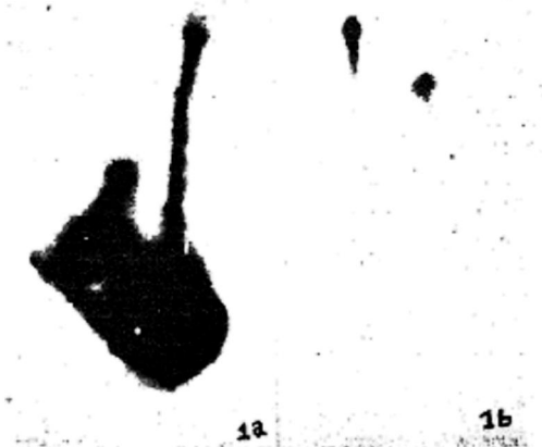
FIG. 1. (a) Ovary, style and stigma of N. rustica (left) and N. glauca (right) plants grown in 32 P solution. (b) Growth of rustica pollen tubes in tabacum styles, 72 hours after pollination. (Autoradiographs—Natural size.)

modified schedule of Buchholz's method. 3 Thus, the tracer technique provides a correct picture of the extent of pollen tube growth.